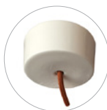
Cream ceramic ceiling rose