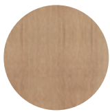
White oiled Oak