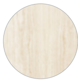
White oiled Ash