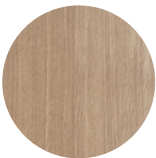
Solid European oak white oil finish