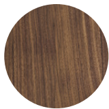
Solid black American walnut lacquer finish