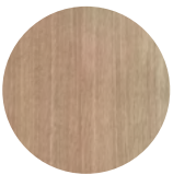
Solid European oak white oil finish