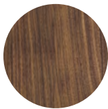
Solid black American walnut clear oil finish